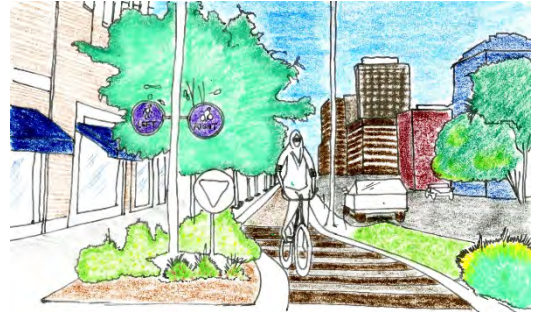
Figure 3: Cultural Trail sketch by Simran Bhinder, MURP, '18.

What's the cultural trail? It's eight miles of wide trails for bicyclists and pedestrians connecting six cultural districts throughout the city. Special landscaping and art installations are sprinkled throughout the trail which runs alongside city streets but is separated from traffic. Businesses have cited the trail as the deciding factor in where they locate.