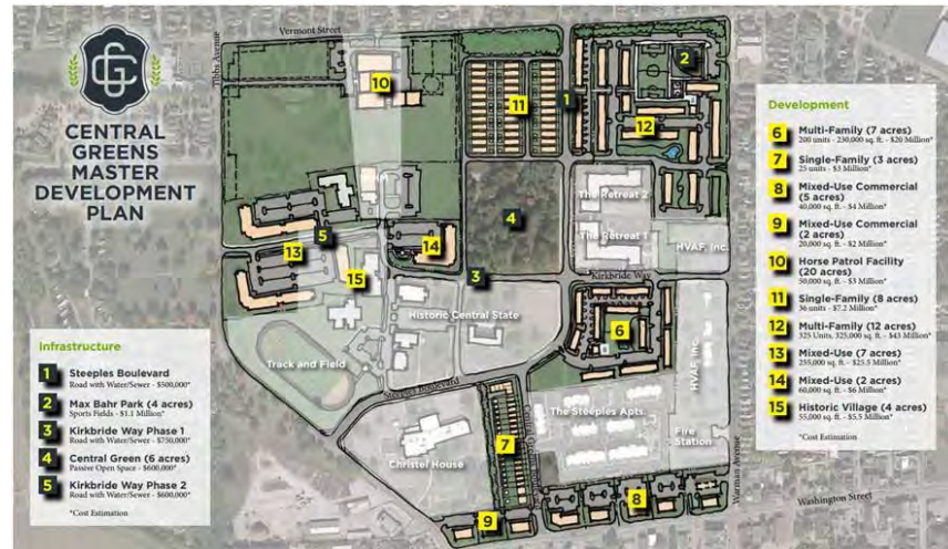
Figure 2: Development plan provided by Holladay Properties.

10 a.m. we take a short walk north to The Platform where the College of Architecture and Planning shares space with ... .. in a building adjoining City Market. A farmer's market is set up in the street, and the plaza is filled with people soaking up the glorious weather and some quiet guitar music.