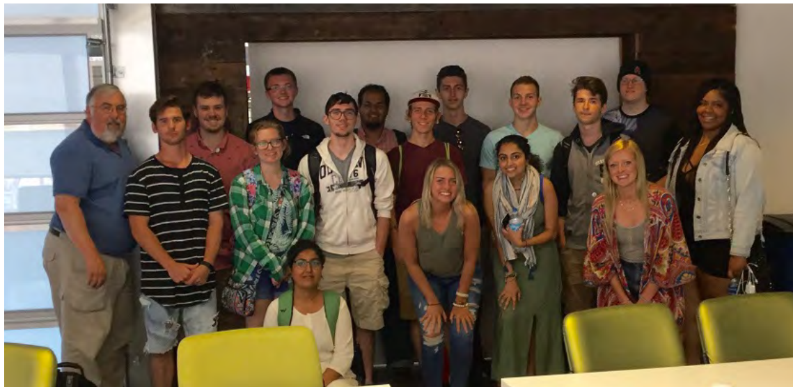
Figure 8: It was a long day, but we met interesting people and learned that planners do many different jobs!

6 p.m. We’re back in Muncie. Homework time!