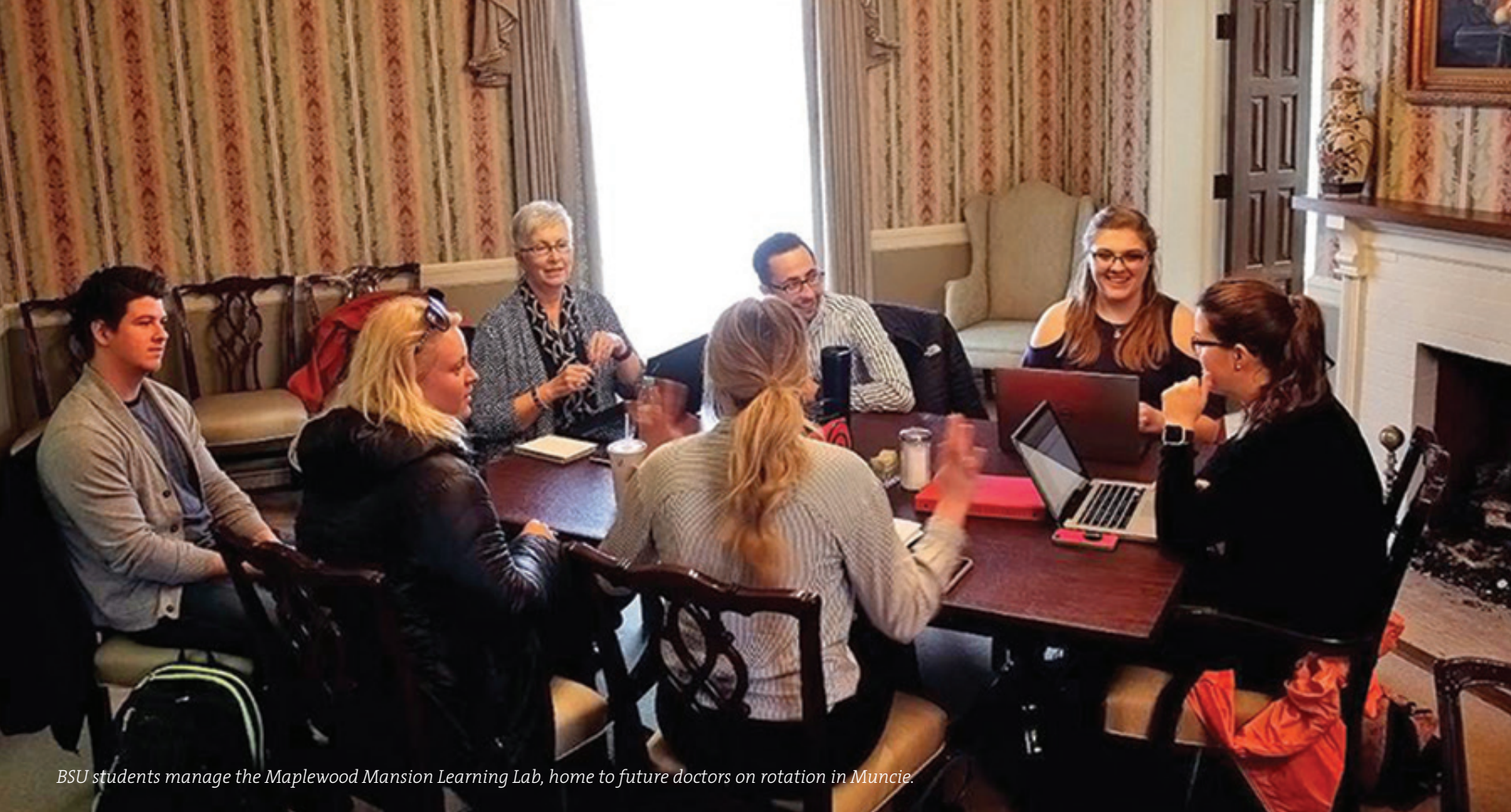
BSU students manage the Maplewood Mansion Learning Lab, home to future doctors on rotation in Muncie.