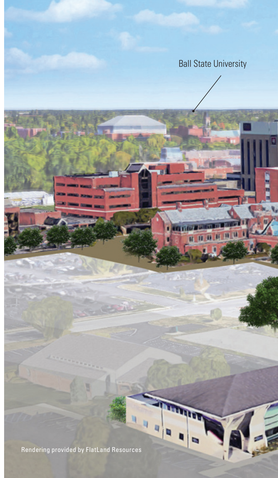
Ball State University