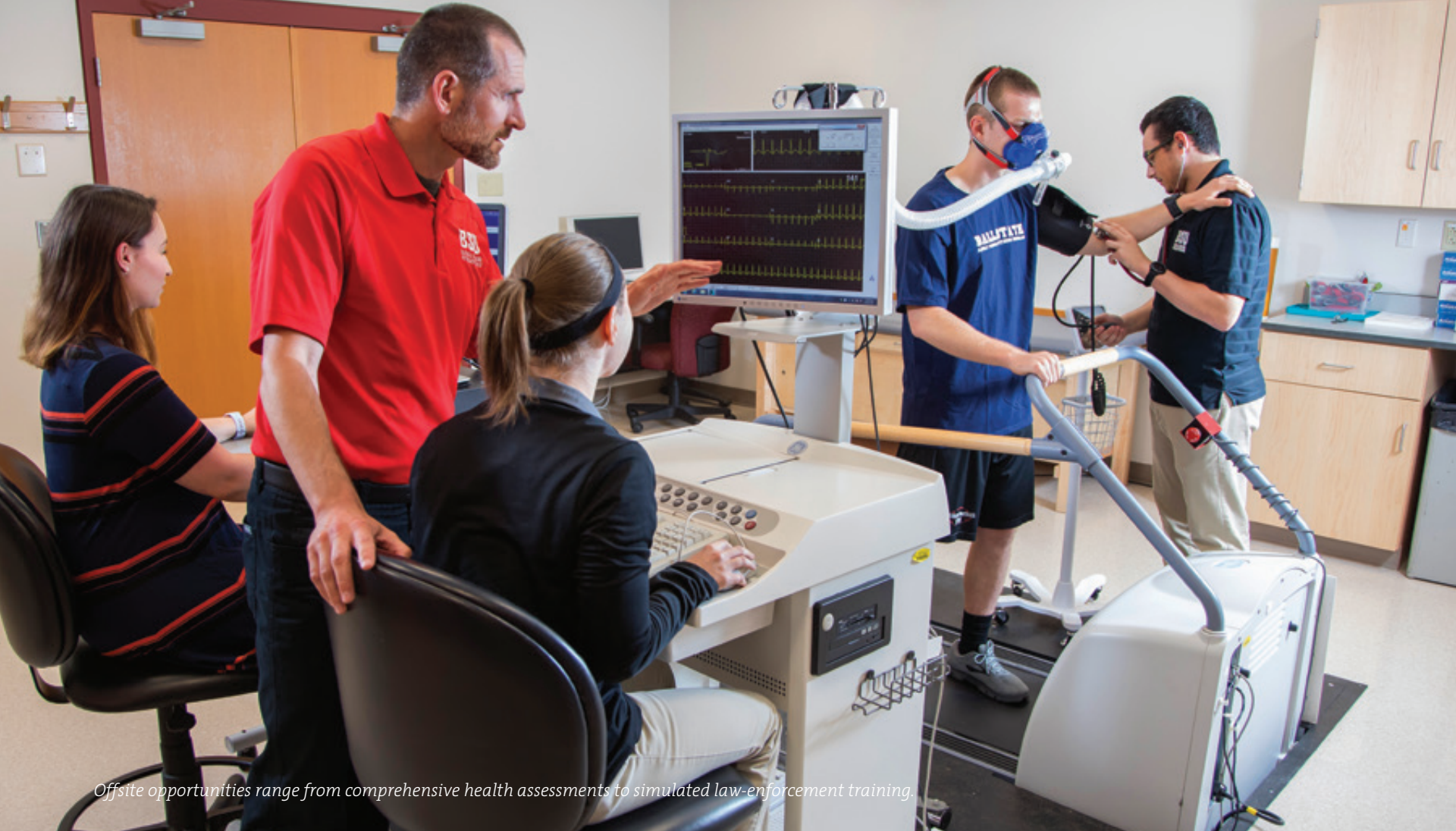
Offsite opportunities range from comprehensive health assessments to simulated law-enforcement training.