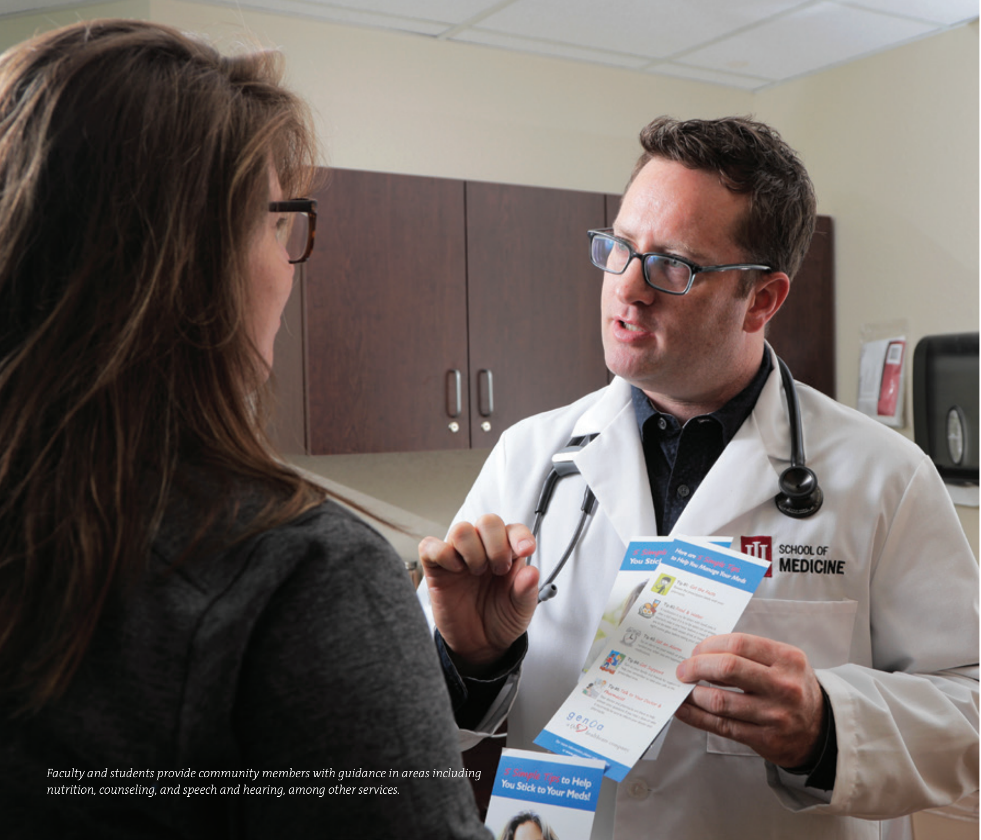
Faculty and students provide community members with guidance in areas including nutrition, counseling, and speech and hearing, among other services.