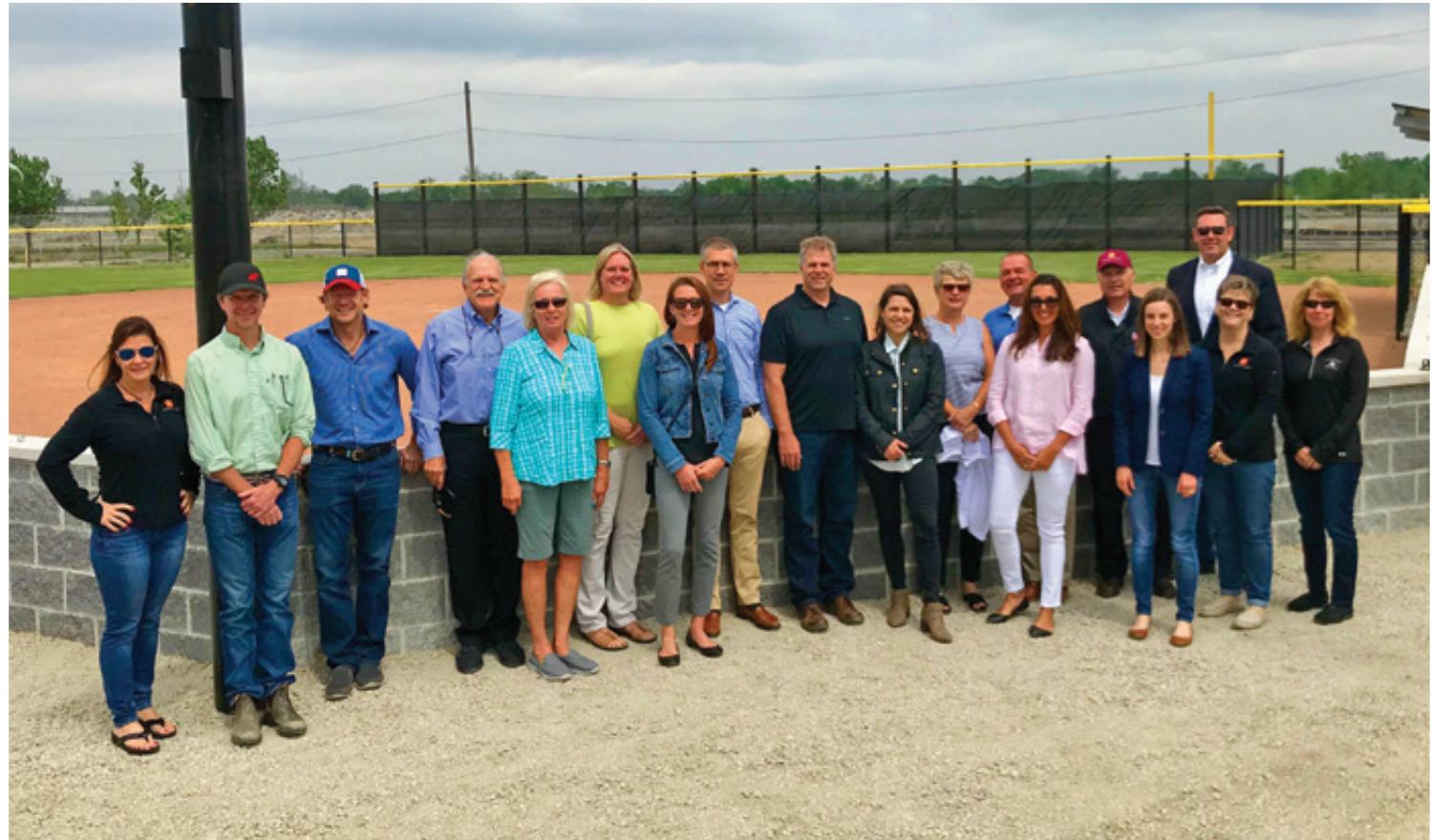
Ball Brothers Foundation's board includes third and fourth generation family members as well as non-family community members. This photo was taken after a recent board meeting and includes BBF staff, board members, and associate directors. It was taken at one of the Ross Center's new fields.