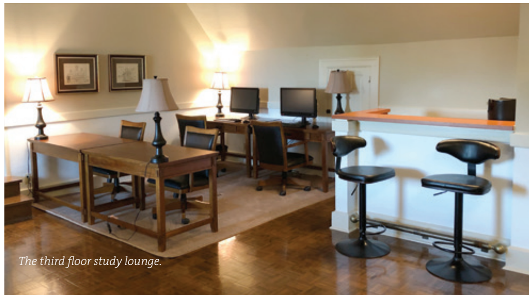
The third floor study lounge.