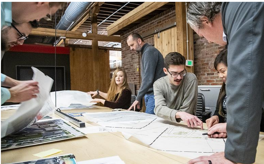
MUD is based in Indianapolis, IN. Course are held at CAP: INDY, 25 North Pine Street along the Washington Street corridor in Indianapolis.

Visit bsu.edu/urbandesign for more information about financial assistance (i.e., graduate assistantships and scholarships).