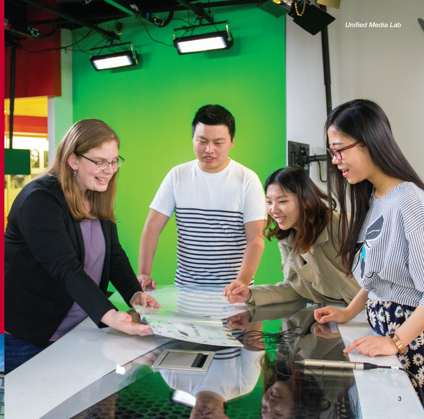
Unified Media Lab