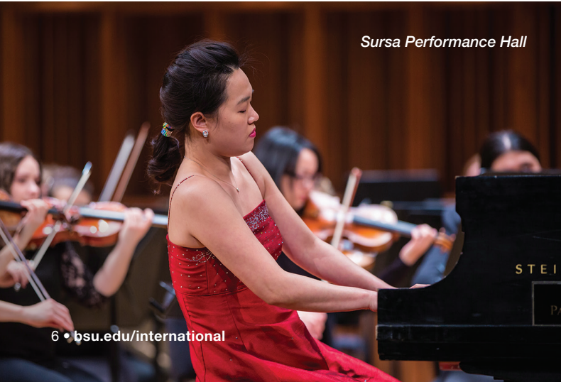
Sursa Performance Hall

Are you ready for a step up in your career, or do you want an even deeper understanding of your discipline? Ball State's Graduate School can get you there. We offer the flexibility to take classes on campus or online so you can choose what works best for you. Plus, our world-acclaimed faculty and facilities can immerse you in hands-on opportunities that focus on our innovative approach to learning.