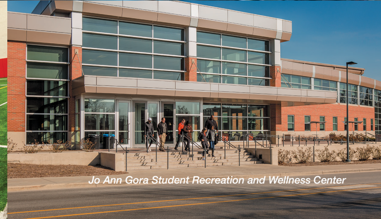
Jo Ann Gora Student Recreation and Wellness Center