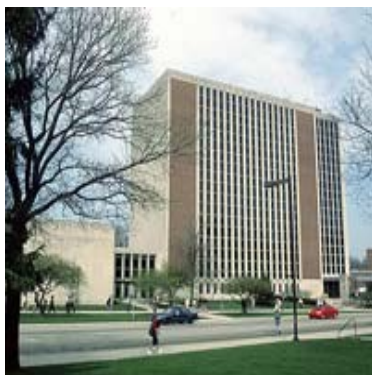
Ball State University Counseling Practicum Clinic Phone: (765) 285-8047

Teacher's College Intersection of Riverside and McKinley Ave