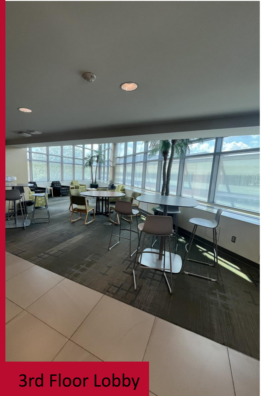
3rd Floor Lobby

The lobby spaces are open for anyone to hangout or work in while in the dorms.