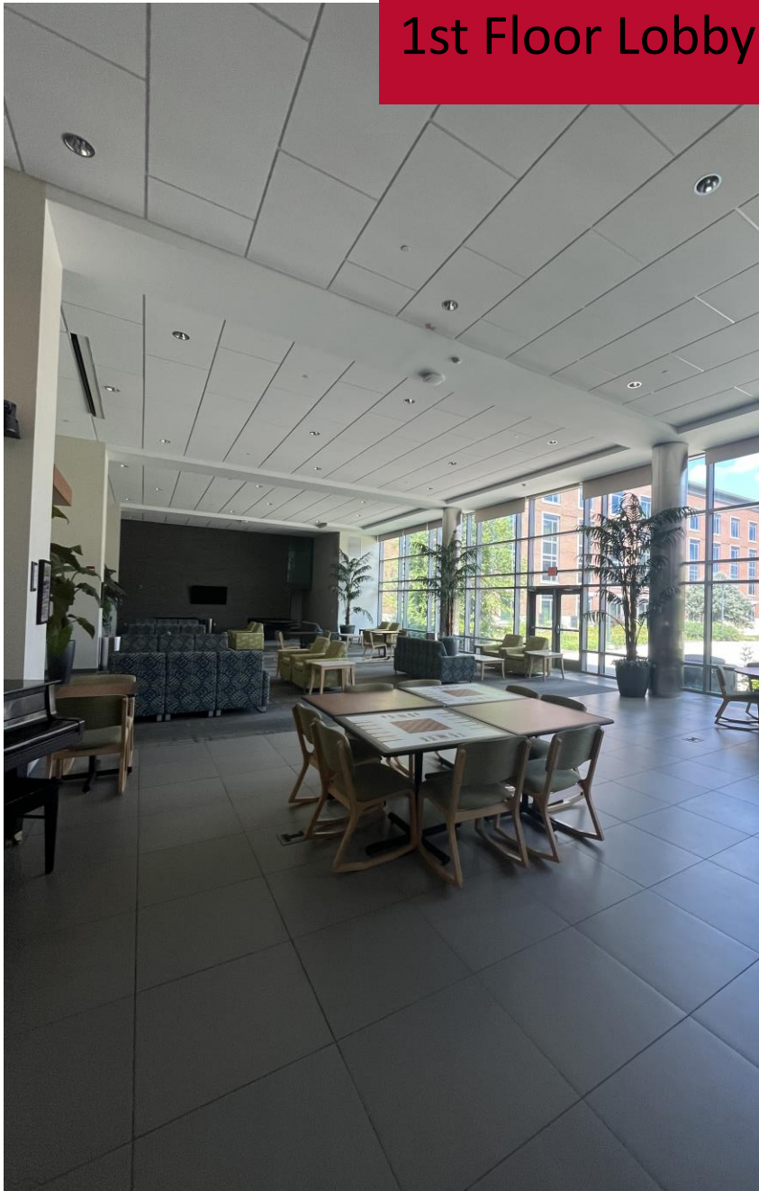
1st Floor Lobby