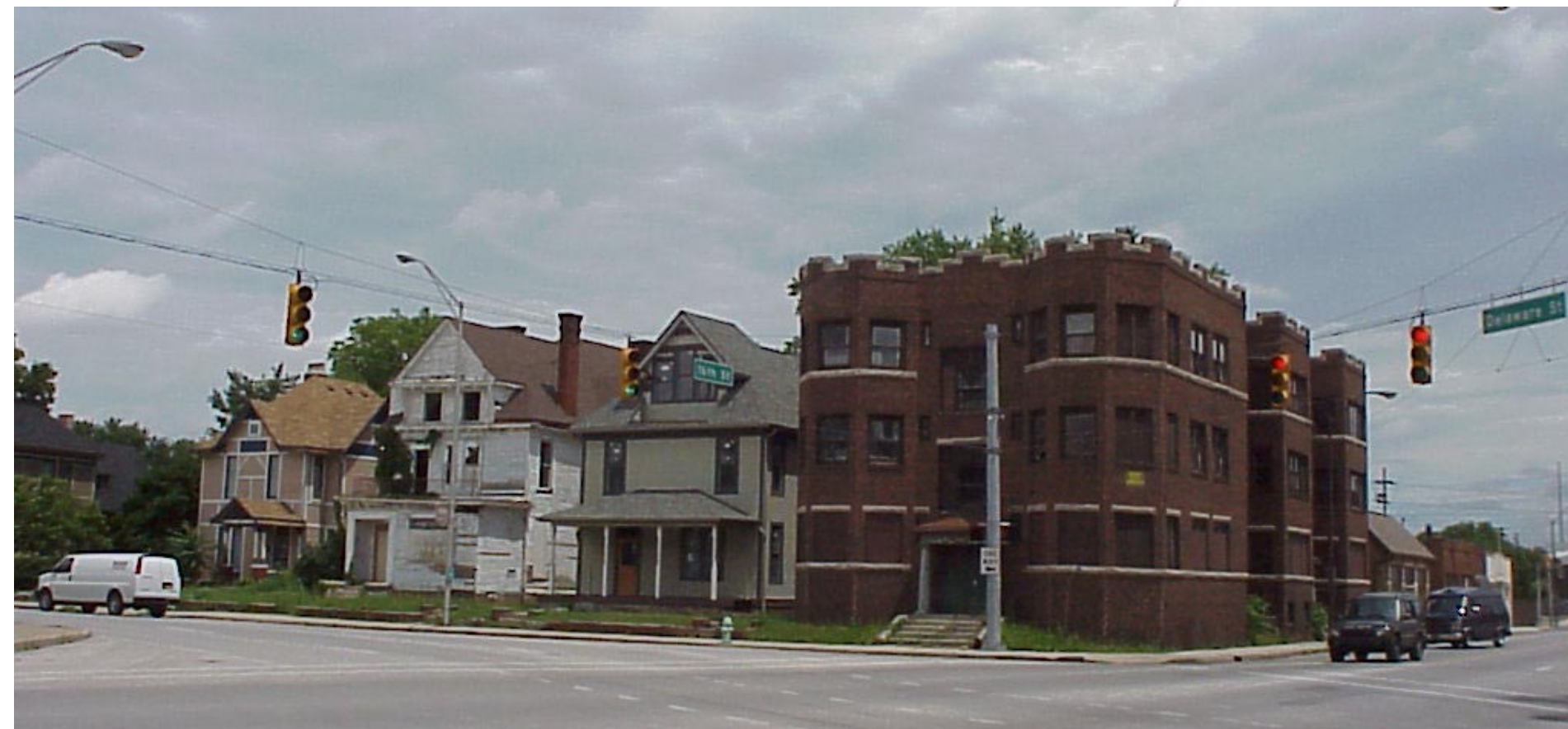
16th Street and Delaware Street

Sixteenth Street was historically a dividing line between two developments and many of the streets do not exactly line up. Many north/south streets like Pennsylvania Street and Delaware Street have had their intersections with 16 th Street “smoothed,” leaving small pieces of land that for most purposes is not developable. These corner properties represent an opportunity to develop public places and used as bus stops, farmers markets, public art venues, or simple pocket parks.