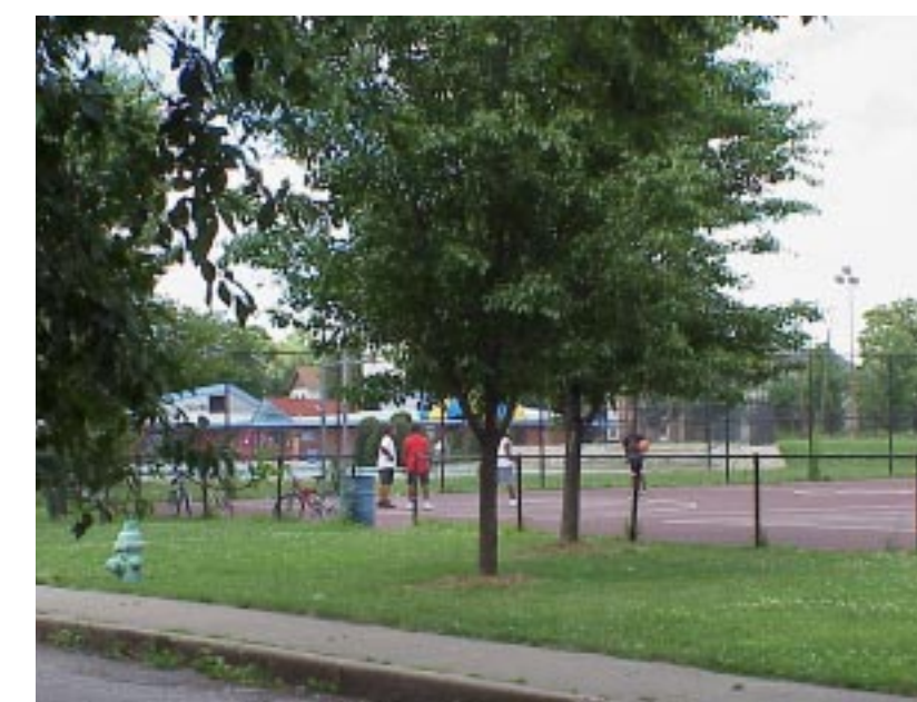
Basketball Courts at King Park

Because 16 th Street was always a side street—property lots front on the north/south streets—an opportunity to convert some of those parcels along 16 th Street into an urban parkway exists. Selective demolition along certain blocks and/or new development pushed farther back would provide a "parkway" pedestrian link between the Monon Trail and Fall Creek Greenway. This alternative is definitely radical. It would transform the street from a commercial traffic street with a focus on the automobile into a "green" street oriented to the pedestrian. It would require substantial investment and planning, as any new