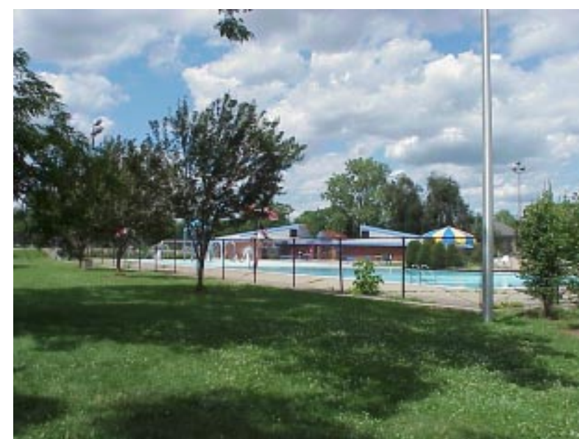
Swimming Pool at King Park

Parks are vital to urban neighborhoods as they provide relaxation and recreation opportunities for families and children. Parks also often serve as a community center. This was true when Robert Kennedy visited the park in the aftermath of the assassination of Dr. King to help console and reconcile a divided community.