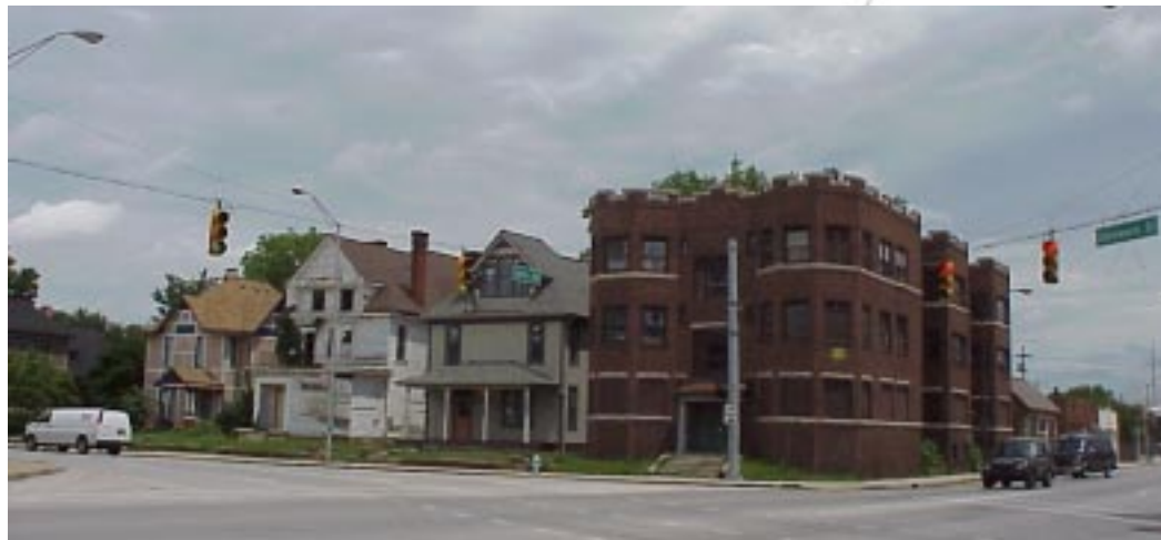
16th Street and Delaware Street

Sixteenth Street was historically a dividing line between two developments and many of the streets do not exactly line up. Many north/south streets like Pennsylvania Street and Delaware Street have had their intersections with 16 th Street “smoothed,” leaving small pieces of land that for most purposes is not developable. These corner properties represent an opportunity to develop public places and used as bus stops, farmers markets, public art venues, or simple pocket parks.