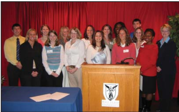
2006 Honors and Awards Recipients