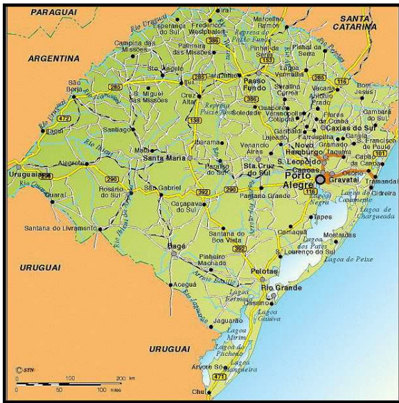
Rio Grande do Sul