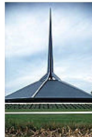
North Christian Church, Columbus, Indiana, by Eero Saarinen.