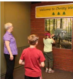
Children enjoyed "Pin the tail on the raccoon" using a photo of Christy Woods, which was printed on the Libraries' large format plotter.

Over all, camp participants had a great time visiting Bracken Library. When it was time for them to leave, the children received diplomas signed by Ball State's mascot, Charlie Cardinal. Of course, he signed with his bird track marks.