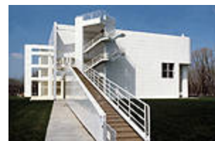
Atheneum, New Harmony, Indiana.