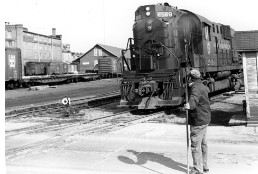
A railroad crossing watchman in 1957 holding a sign outside his shanty as Norfolk and Western engine 2568 crosses.