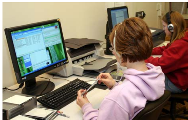
Ball State University Libraries have gained a national reputation for their work on digitizing oral histories.

It provides a centralized, coordinated, and user-focused resource to serve the teaching, learning, academic achievement, and research needs of students, faculty, and others. The DMR brings together the digital collections and projects of the University Libraries into a single, cohesive, accessible, easy to navigate, Web-based environment, while also providing access