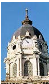
Cupola, Delaware County Courthouse, demolished in 1966.