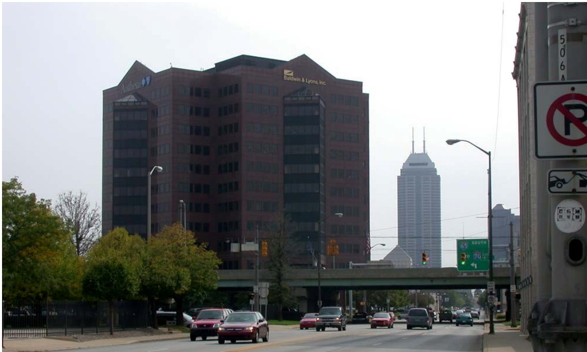
Downtown Gateway – Great Location for Image Marker