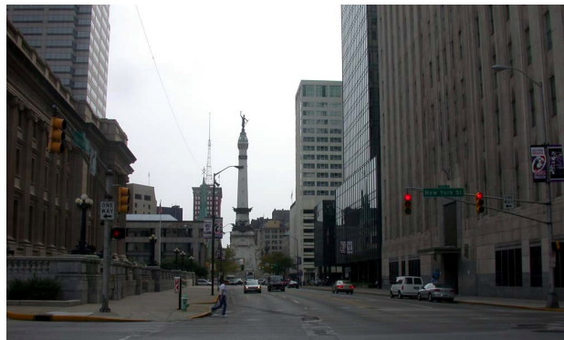
Iconic Image but Uninspired