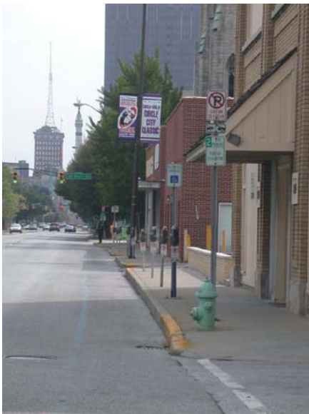
Signage – Not Coordinated